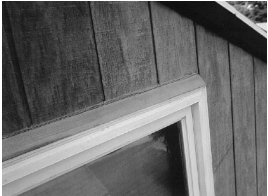
Figure 1—Site-fabricated sloped drip cap above window with pine brick molding installed over plywood panel siding. Seal at top of drip cap is urethane caulk. Seal has remained functional, but it is beginning to show surface cracking. Drip cap and caulk seal were installed in September 1983; photo was taken in June 1997.

Interface of vertical trim and siding —Water entry through the interface between vertical trim and siding is not likely to be significant, except when siding is installed diagonally. (See section on siding orientation for information on diagonally installed siding.) Nevertheless, water entry at this interface is possible. Provided that these joints do not function as drainage paths, caulk seals at these locations will most likely be