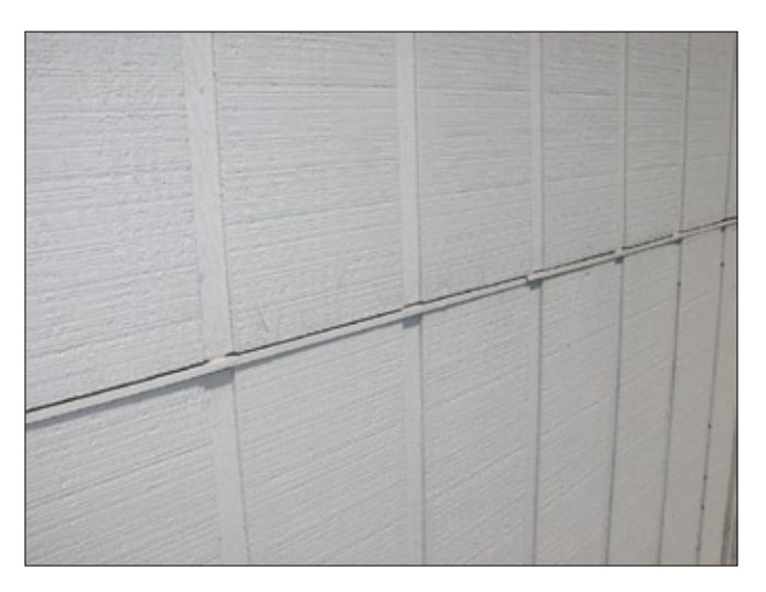
Figure 10—Metal Z-flashing at a horizontal joint in plywood panel siding. The second-story (upper) plywood panels should have been installed approximately 3 mm (1/8 in.) higher than in this installation. This would have provided more adequate drainage space between their lower edges and the horizontal leg of the Z-flashing (a paint bridge between the siding and the Z-flashing can be seen at the left-most groove in the photo). Well executed Z-flashing (without caulk) has proven effective at joints like the one shown here.