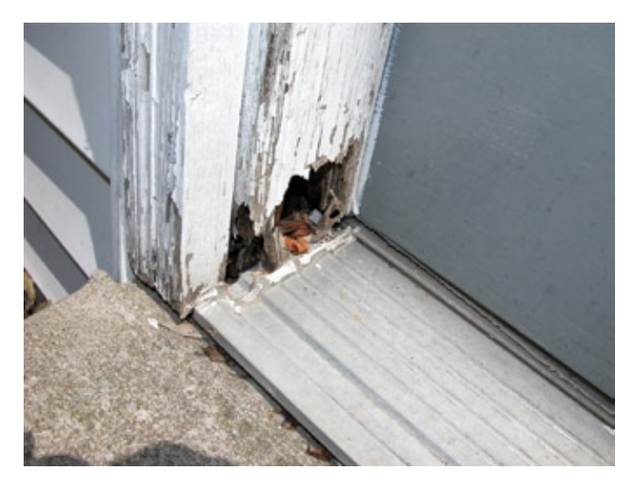
Figure 13B—Extensive jamb decay in a contemporary exterior entry door. The decay was in all likelihood exacerbated by the short length of fillet joint that blocked drainage at the outside lower edge of the jamb.

Figure 13A—A failed fillet caulk joint between the ribbed aluminum sill and the pine jamb and jamb casing of a contemporary exterior door. The ribs retard drainage off the aluminum sill. The short length of fillet that runs parallel to the ribs also retards sill drainage and does so at a critical location.