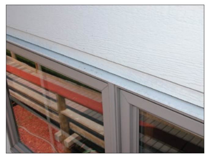
Figure 12—Transition between a contemporary finned window (below) and OSB horizontal lap siding (above). The window shown has been field-mulled (multiple units joined side-to-side). A metal head flashing is used that shingle-laps behind the siding above and covers the end of the mull cap. Caulk is not used between the head flashing and the siding, as it would block drainage off the flashing.

function indefinitely. Sealant joint failure can occur without obvious indication (Fig. 9).