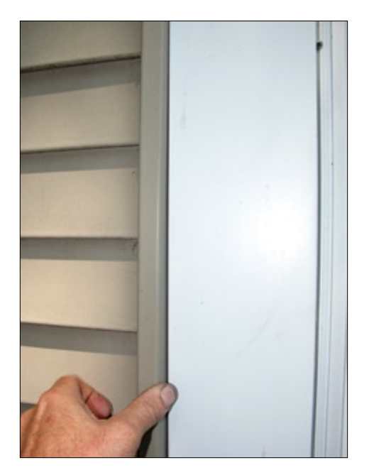
Figure 4B—Interface of vinyl siding J-channel receptor and aluminum window jamb trim. Outward thumb pressure against the J-channel reveals that there is no caulking between the J-channel and the jamb trim. This is consistent with installation guidance available from the trade association for vinyl siding. This installation was about a decade old when the photo was taken and had performed acceptably.