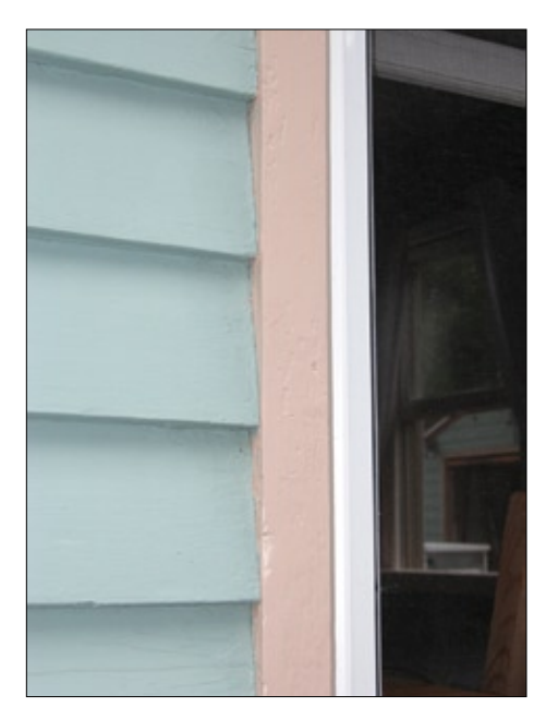
Figure 1B—Painted redcedar lap siding butting tightly against a window casing without caulk. Photograph taken summer 2005 on a single-story home built in 1940.