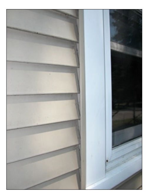
Figure 4A—Vinyl siding terminating in a J-channel receptor along window jamb trim.

Figure 3—Wood drip cap, atop window head casing, installed in shingle-lap fashion with redcedar trim and without caulk. In this example, there is no metal head flashing over the wood drip cap and behind the siding. Water intrusion between the drip cap and the siding could be expected if this detail were exposed to significant wind-blown rain. A modest 0.3 m (12 in.) roof overhang on this single-story home evidently provided adequate shelter from wind-blown rain. This is the same window shown in Figure 1B.