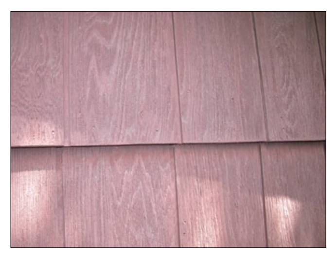
Figure 11—A shingle lap horizontal joint in plywood panel siding. At the time this photo was taken, the joint shown had performed adequately for in excess of four decades with no maintenance.

Figure 10—Metal Z-flashing at a horizontal joint in plywood panel siding. The second-story (upper) plywood panels should have been installed approximately 3 mm (1/8 in.) higher than in this installation. This would have provided more adequate drainage space between their lower edges and the horizontal leg of the Z-flashing (a paint bridge between the siding and the Z-flashing can be seen at the left-most groove in the photo). Well executed Z-flashing (without caulk) has proven effective at joints like the one shown here.