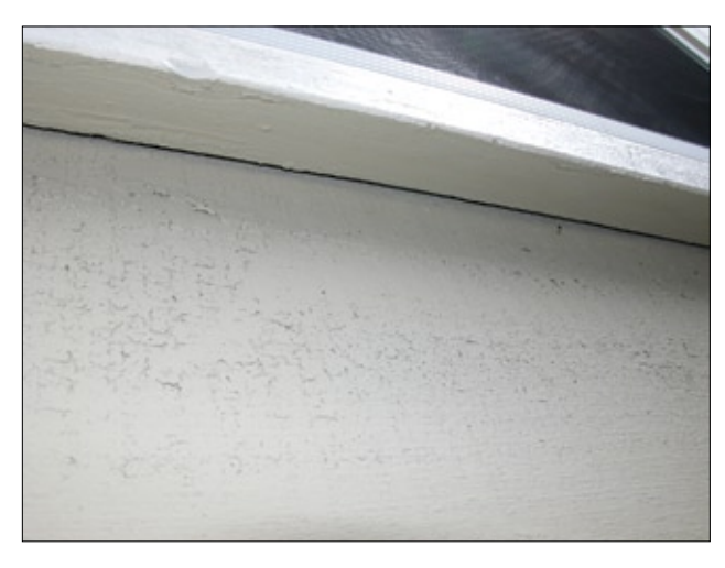
Figure 2—Wood siding shingle-lapped with an outwardly sloped wood window sill without caulk. Photograph taken in summer 2005 on a 1\frac{1}{2} -story home constructed in 1916.