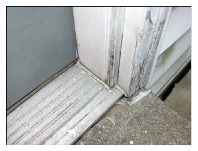
Figure 13A—A failed fillet caulk joint between the ribbed aluminum sill and the pine jamb and jamb casing of a contemporary exterior door. The ribs retard drainage off the aluminum sill. The short length of fillet that runs parallel to the ribs also retards sill drainage and does so at a critical location.