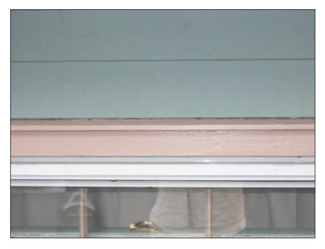
Figure 3—Wood drip cap, atop window head casing, installed in shingle-lap fashion with redcedar trim and without caulk. In this example, there is no metal head flashing over the wood drip cap and behind the siding. Water intrusion between the drip cap and the siding could be expected if this detail were exposed to significant wind-blown rain. A modest 0.3 m (12 in.) roof overhang on this single-story home evidently provided adequate shelter from wind-blown rain. This is the same window shown in Figure 1B.