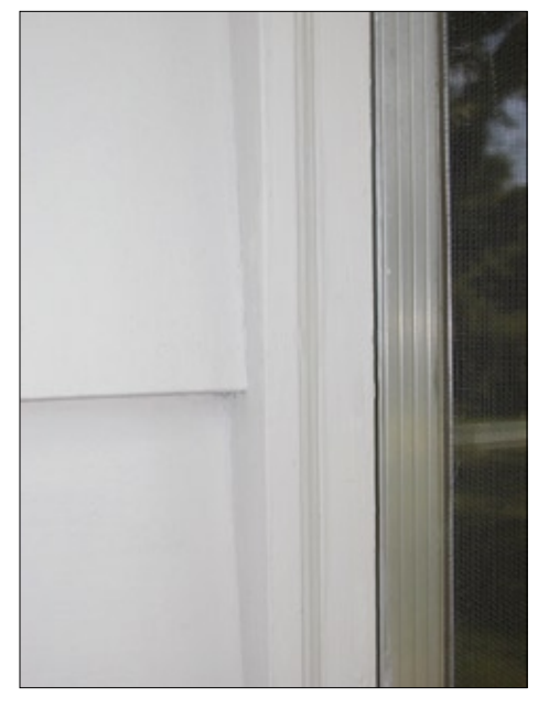
Figure 1A—Painted redcedar bevel lap siding butted tightly to window jamb casing without caulk. Photograph taken summer 2005 on ranch-style home constructed in 1960.

Caulk joints cannot be expected to remain functional indefinitely; leakage will eventually occur. Sealant joint failure can occur by adhesive failure between the caulk and either of the substrates between which a seal is desired. Cohesive failure or chemical degradation of the caulk can also cause sealant joints to fail.<sup>1</sup> Of these possible types of failure, adhesive failure between caulk and substrate is the most common failure mode. ASTM C 1193, Standard Guide for Use of Joint Sealants (ASTM 2005), provides extensive guidance for execution of sealant joints. The guide was developed for use in commercial construction, where caulking is a specialized trade. Many of the principles outlined in the