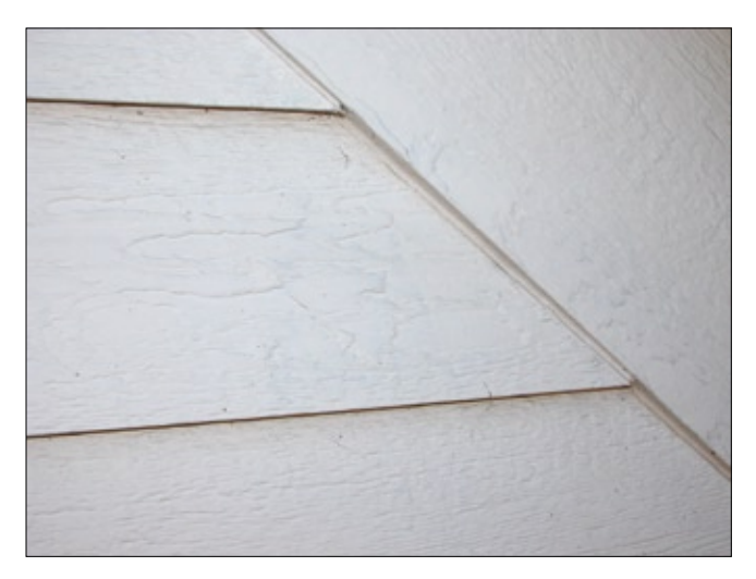
Figure 5—Joint between embossed oriented strandboard (OSB) lap siding and embossed OSB gable-rake trim. The siding is installed without a siding termination channel. The joint is gapped and sealed with caulk, as recommended by the siding manufacturer. Caulk seals were just under 4 years old when photo was taken and were apparently functional.

guide are, however, also applicable to sealant joints in residential construction.