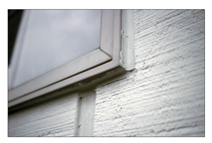
Figure 8—A perimeter sealant joint around a contemporary flanged window. The joint is of appropriate width at 6 mm (0.25 in.). The joint had been in service for roughly 3 years when photo was taken. Joint is mostly intact, but some adhesion failure is evident at lower right corner. As is common in residential construction, neither bondbreaker tape nor sealant backer was used. Joint failure is likely the result of three-sided adhesion, an unprimed siding edge, and other-than-ideal sealant width-depth ratio (sealant depth exceeding width).

No professional consensus exists on how long sealant joints in residential construction can be expected to remain functional. Professionals commonly believe, however, that the service life of residential sealant joints is usually shorter than 20 years. Manufacturers' warranties of multiple decades of sealant joint performance only provide for replacement of the caulking material. Cost of application labor is not covered by the warranties, nor is the cost of repairing damage sustained as a result of a failed sealant joint.